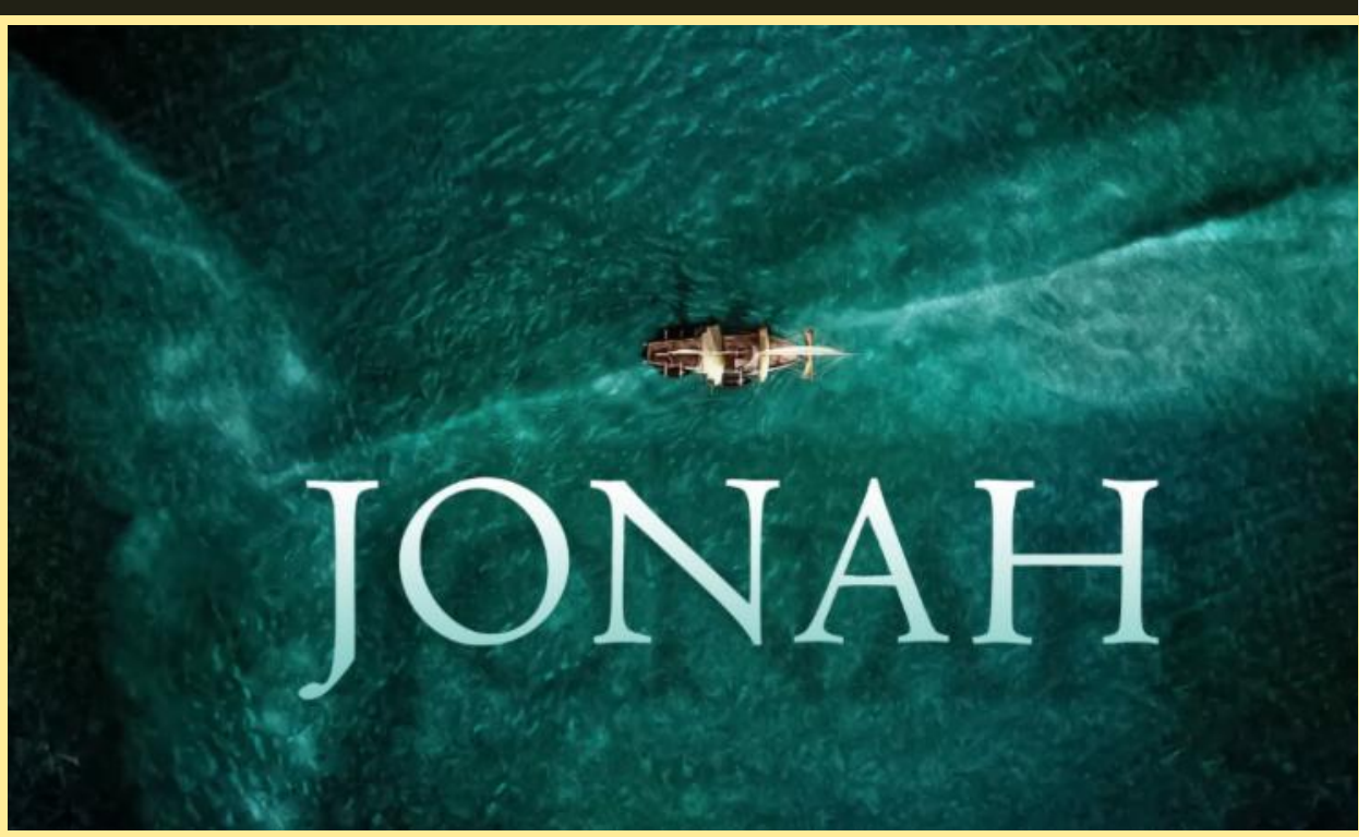
October 11, 2017 The Waysign Church of the Wayfarer